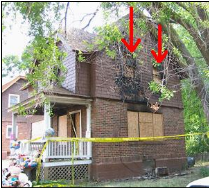
Photo 3: This photo shows where Ladder Company 1 of the Pontiac (MI) Fire Department performed VES to attempt to rescue children who were trapped upstairs. The bulk of the fire was on the ground floor. Six victims perished on the second floor including five children.

Before the VES team enters the structure they must determine where the highest probability of a victim will be. This is determined based on two considerations: 1) Bystanders reports of where victims are trapped 2) The most likely place in the structure where a victim will be located. Where is the most likely place in the structure where we normally locate victims? Battalion Chief John Norman, FDNY (ret), states, “A very high priority must be placed on the search of bedrooms. Due to the fact that the area of highest life hazard, regardless of the time of day, is the bedroom. Statistics nationwide...bear this out and it is a factor that can be easily explained. An alert human being will flee a fire if physically able.”