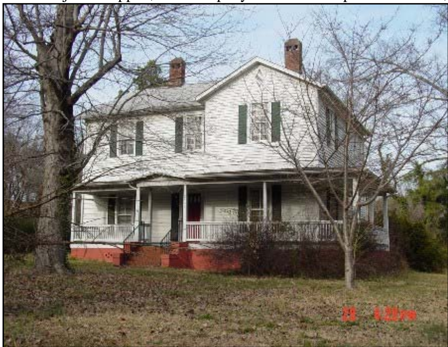
Photo 1: These windows on the second floor lead into bedrooms. The porch roof would give the firefighters an operating platform to perform VES.

Before discussion on how to perform VES, it is critical to understand when to perform VES. VES should be implemented on fires where there is a high probability of life hazard. VES is ideal tactic that can be employed by first due companies who do not have water such as rescue companies or truck companies without pumps. If a rescue company arrived first on scene at a residential house with reports of subjects trapped, the company would size-up the structure, determine where the highest likelihood of viable occupants is, and then perform VES. VES is also a tactic that is ideal to employ with two-story residential structures when the fire has control of an interior stairwell. According to FDNY Battalion Chief Frank Montagna, he advises that when practicable, VES should always be initiated on the upper floors at residential fires. With knowledge of building construction, companies can assume that the majority of the bedrooms will be on the second floor.