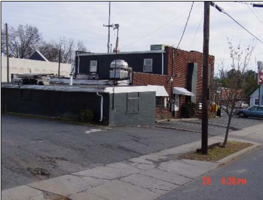
Photo 4: This photo shows a two-story commercial building with a restaurant on the ground floor and a residence on the second floor. With the low height on the roof in the rear, the windows would be ideal to perform VES to gain access to the residence.

Once the VES team determines the entry point, they will vent the window, enter the structure, control the door and then begin their search. Michael Dugan, a seventeen-year veteran and Captain of Ladder 123 in the FDNY teaches that when the VES team enters the room they need to go to the bedroom door and close it if it is open and if it is closed, the firefighters need to briefly open the door. There are two reasons for this. First, they need to assess fire conditions on the outside of the door to determine how long they will be able to operate without a hose line, and secondly to see if any victims are on the outside of the door. Victims will make every attempt to exit the house in the same way that they normally do. Some fire victims are found outside bedroom doors where they succumbed while trying to escape the fire.